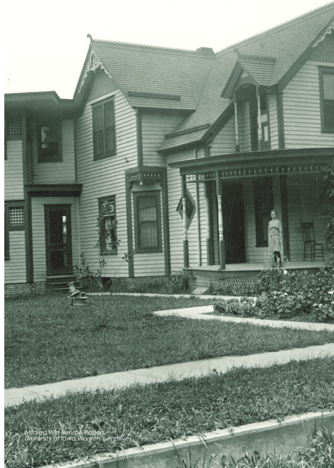
Mildred Wirt Benson Papers, University of Iowa Women's Archives

Later, Millie also would venture into journalism and wrote for the Toledo Times and the Toledo Blade newspapers. Millie, ever dedicated, died at age 96 after completing a column and full workday at the Toledo Blade .